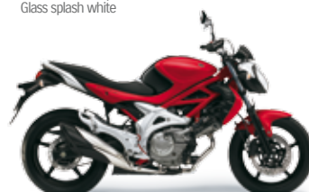
Pearl nebular black / Pearl mira red