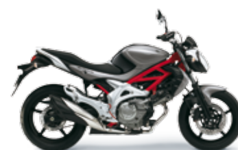
Metallic oort grey / Metallic phantom grey