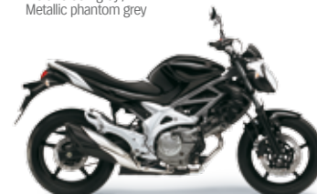
Pearl nebular black