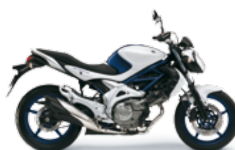
Pearl Suzuki deep blue / Glass splash white